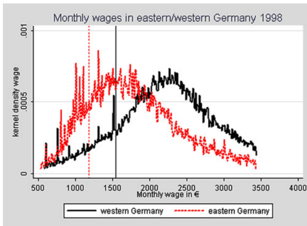
Fig. 1 Wage distributions in western and eastern Germany in 1998. Note: Vertical lines indicate low-wage thresholds. Wages are right censored at the contribution assessment ceiling