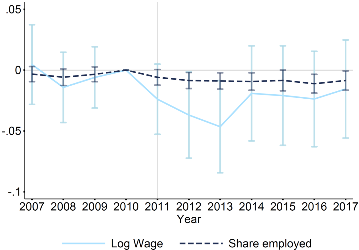
Unemployment Rate in Czech Republic (Municipalities)

Data Source: German social security data (IEB)