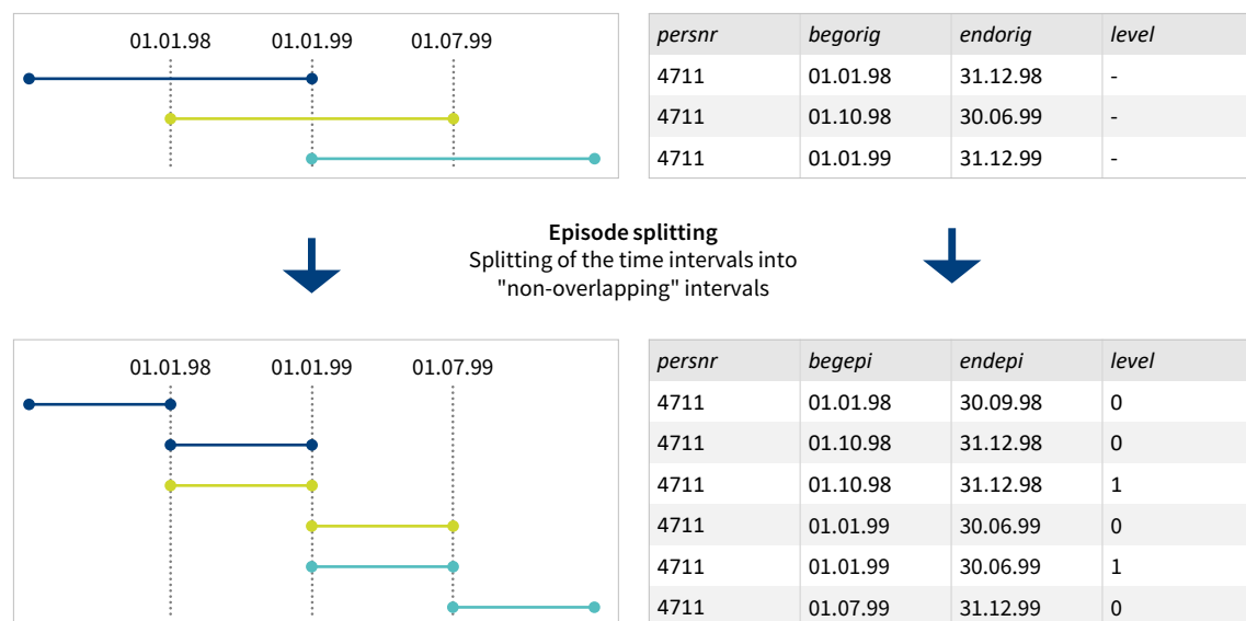
Figure 3: Episode splitting

It is advisable to sort entirely parallel observations generated by the splitting procedure in a consistent manner. The variables ‘observation counter per episode’ ( level2 ) and ‘observation counter per episode and source’ ( level1 ) that were previously contained in the SIAB can be generated using the following Stata commands if required (see Box 2).