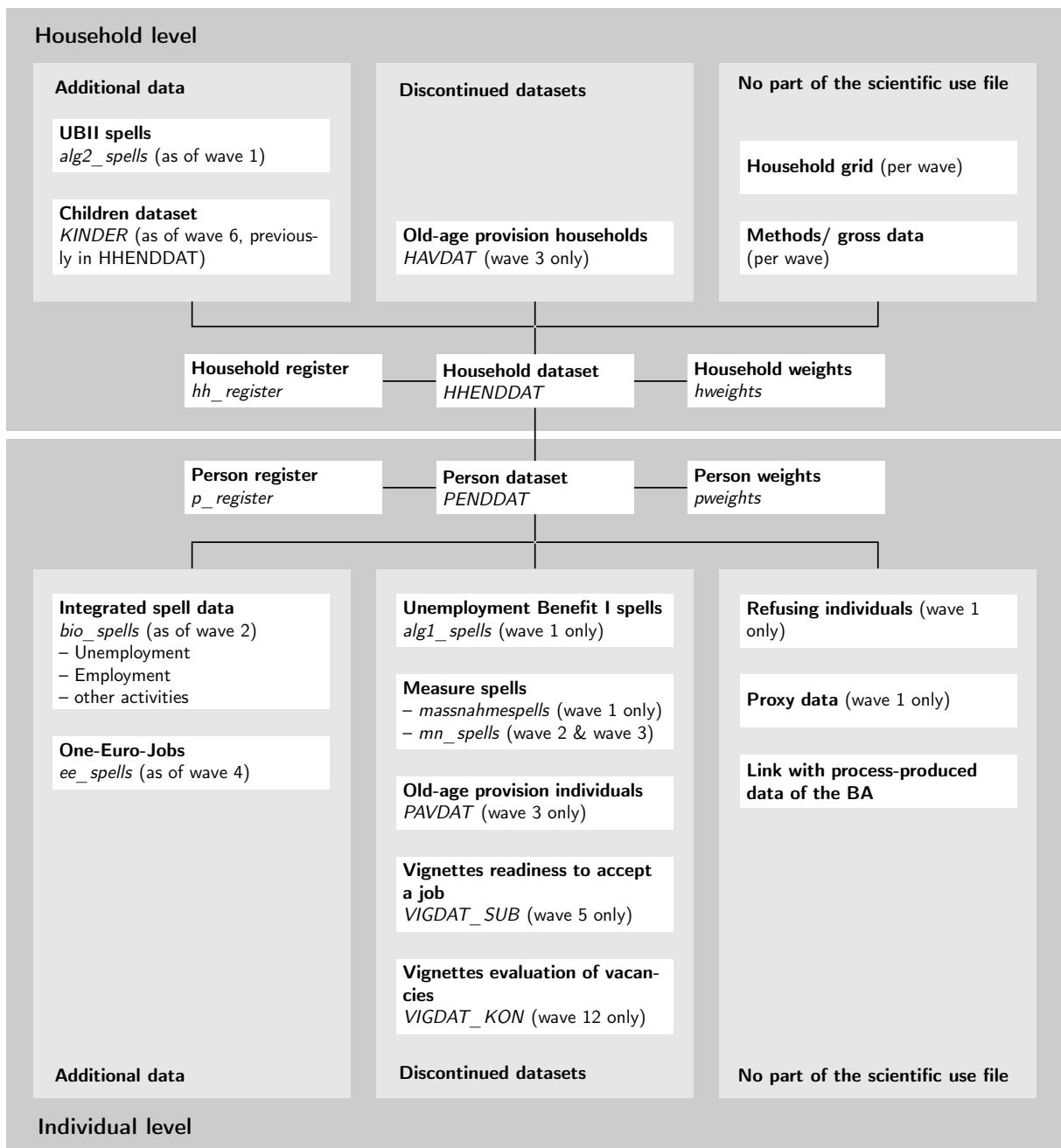
Figure 2: Dataset structure of PASS in wave 14