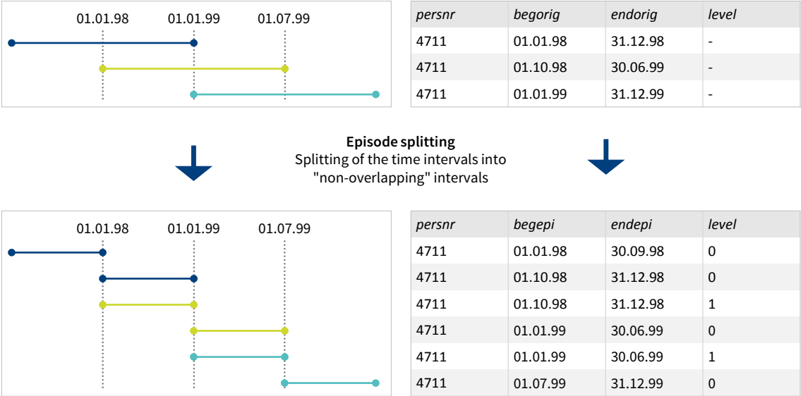
Figure 3: Episode splitting

The original date variables for the beginning and the end of the original observation ( begorig and endorig ) are retained, the variables 'start date of the split episode' and 'end date of the split episode' ( begepi and endepe ) mark the beginning and the end of the split episodes. It is possible to establish whether observations have been split by comparing the original period ( begorig and endorig ) with the episode period ( begepi and endepe ).